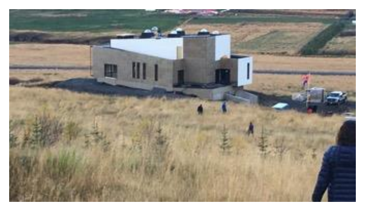
CIAO's first Aurora measurements were conducted in October 2013

National Space Science Center, Chinese Academy of Sciences (CAS); Institute of Geology and Geophysics, CAS; China Research Institute of Radio Wave Propagation; National Center for Space Weather; Institute of Space Physics and Applied Technology, Peking University; School of Electronic Information, Wuhan University; School of Earth and Space Science, University of Science and Technology of China; School of Space Science and Physics, Shandong University